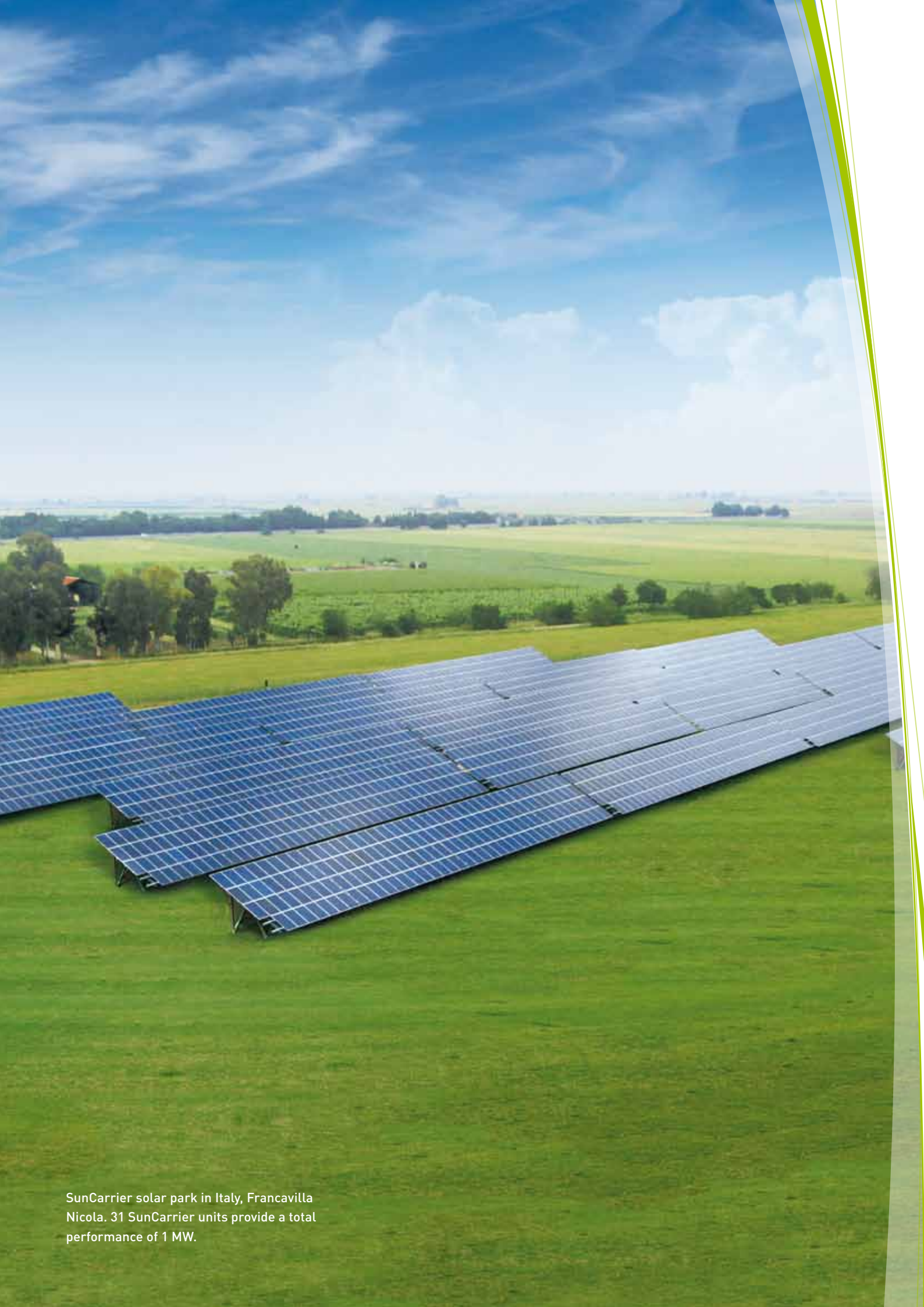
SunCarrier solar park in Italy, Francavilla Nicola. 31 SunCarrier units provide a total performance of 1 MW.